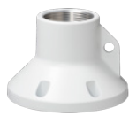
WV-QCL101-W Mount Bracket