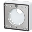
WV-QJB500-W Mount Bracket