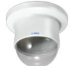
WV-QCD100C-W Dome Cover