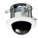
WV-QED100G-W Ceiling Mount Bracket