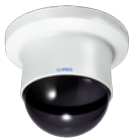
WV-QCD100G-W Dome Cover